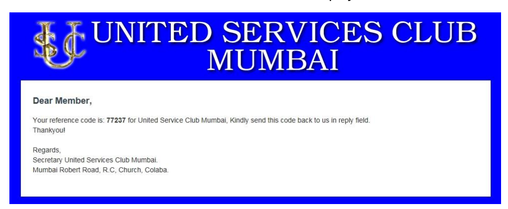
Figure 2. HTML file from variant 1b[3] resources.

According to virustotal version 1a[2] of the first variant was submitted on 2018-03-28. The variant 1b[3], which was submitted on 2018-03-31, is 5.5KB bigger. This is because the variant 1b contains HTML file within its resources. Below is a screenshot of the displayed file.